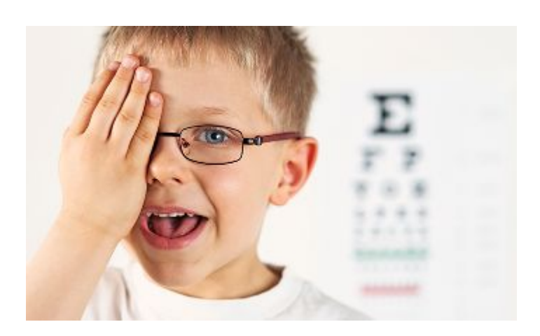
Eyesight Protection for Kids

The International School Class of 2021 thanks you for your support!